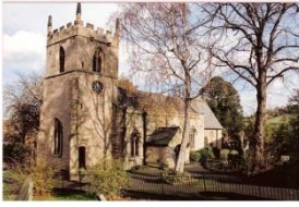
An introduction and guide